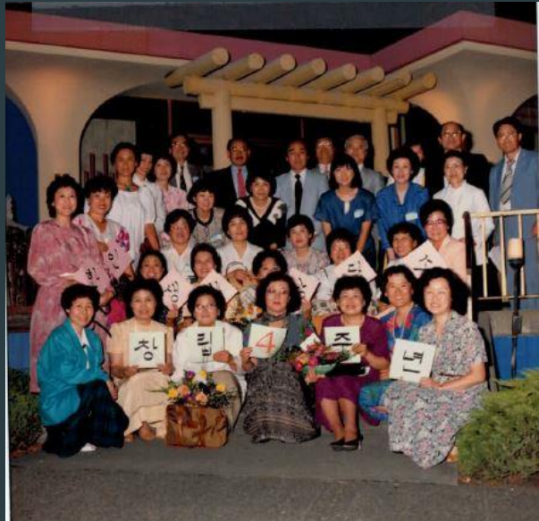
(Early Picture in 1987)